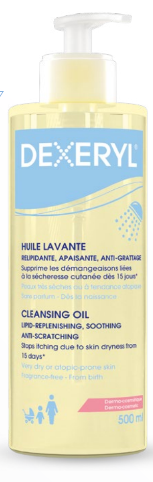
Face, body and intimate areas