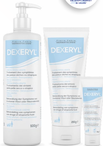
CARE MEDICAL DEVICE